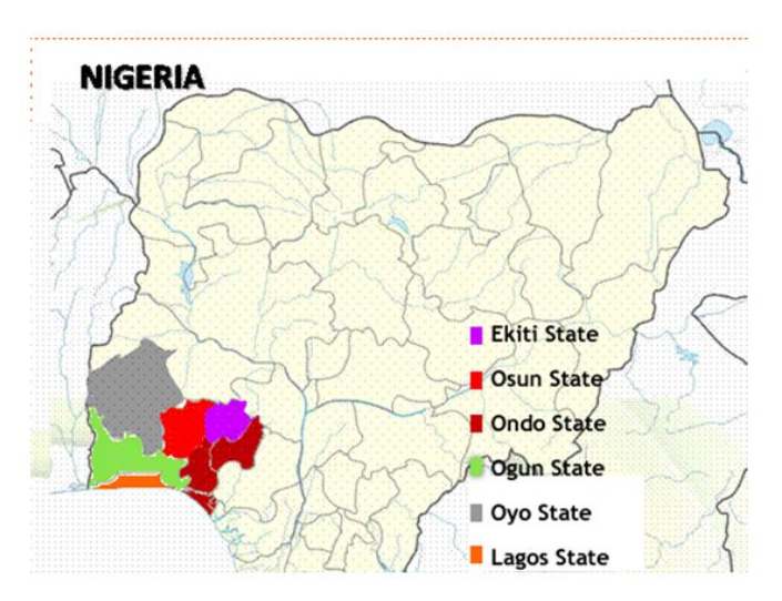
Figure 1: Map of Nigeria Showing the States in the South-Western Nigeria (Longitude 30° and 7°E and Latitude 4° and 9°N)

The study area is the south-westernNigeria Figure 1 located between longitude 30° and 7°E andlatitude4° and 9°N. The region comprises six States; Oyo, Osun, Ogun, Ondo, Ekiti and Lagos State Figure 1. The total land area is about 191,843 square kilomaters (Iloeje, 1981). The weather conditions exhibits two distinct seasons; the rainy season (March - October) and the dry season (November - February). The dry season is characterized by harmattan dust and cold dry winds from Sahara deserts.